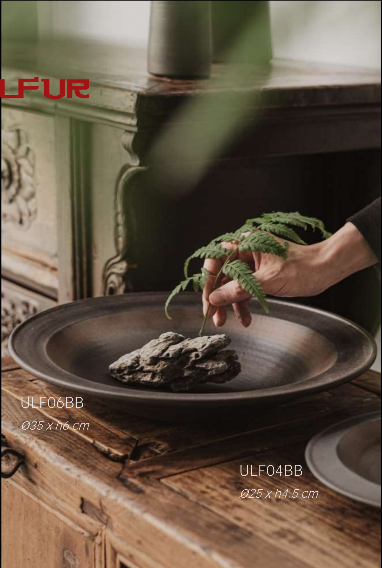
ULF06BB Ø35 x h6 cm