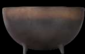
OTA08BB Ø15x8 cm