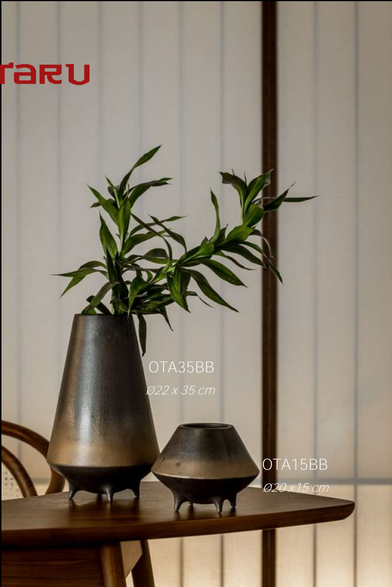
OTA35BB Ø22 x 35 cm