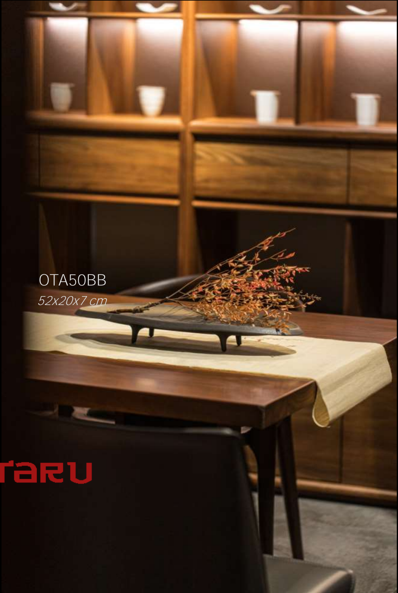
OTA50BB 52x20x7 cm